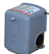
Pressostato di sicurezza a riarmo manuale "Square D" "Square D" safety manual resetting pressure switch