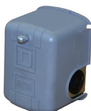
Pressostato Pressure switch