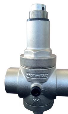
Riduttore di pressione Pressure reducer