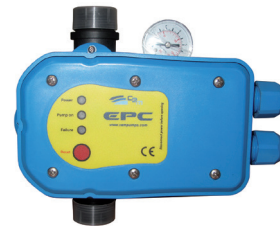
EPC (Electronic Pressure Control)